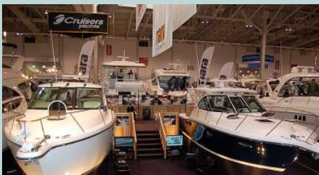
Tiara and Pride Marine Group

Exhibitors across the board are reporting a great Toronto Show with significant sales increase from last year, despite a slight reduction in attendance. Consumer confidence is up and there is a general feeling that the economy is rebounding. Boating is alive and well. There are some positive indicators for the boating industry. We have seen an upswing in auto and RV sales and this should translate into an increase in the sale of NEW and USED BOATS.